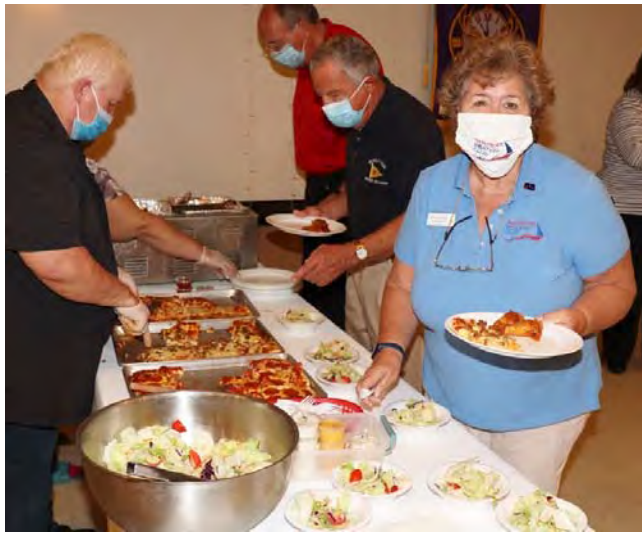
Pizza And Wings are Served