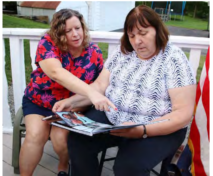
Picnic Pictures continued in the August Issue