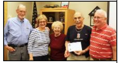
The staff of the SeaChest was again presented with the Distinctive Communicators award for the 2016 year.